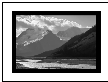
PICTURE LOCKED TO THE WALL