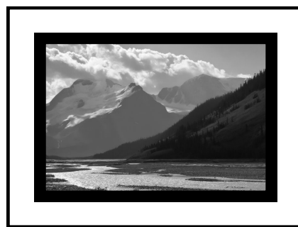
PICTURE LOCKED TO THE WALL